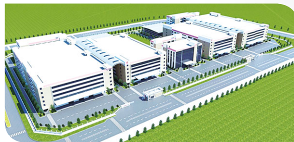
Fourth Vietnam Facility (Under planning) 第四家越南廠 (規劃中)