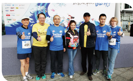
Picture 2 the Chief Operating Officer of the Group participating in the “Run for Survival” 圖2 集團首席運營官參加「生態保衛賽」

The employees of the Group volunteered to participate in the mudflats cleaning activities of Ocean Park Conservation Foundation Hong Kong to help solve the environmental problems around us. At the same time, the activity gave the public a better understanding of the local wildlife ecology, thereby enhancing the conservation awareness of the participants.