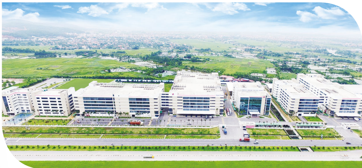
First Vietnam Facility 首家越南廠

雖然胸杯的生產逐漸由深圳遷移至越南，但深圳廠房將繼續於本集團的發展扮演重要角色。縱使深圳廠房於上半年面臨人手短缺的問題，但維珍妮於農曆新年後已增加員工人數至超過18,000名。來年，預期員工人數將維持相對穩定，使本集團能夠滿足客戶的殷切需求。縱然面對深圳的最低工資於2017年6月起由人民幣2,030元上調5%至人民幣2,130元，但深圳廠房未來將繼續作為本集團的生產兼主要研發基地，使維珍妮既能夠應付品牌合作夥伴短交貨期的訂單，亦可繼續生產創新的優質產品。