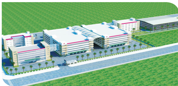
Third Vietnam Facility (Under planning) 第三家越南廠 (規劃中)