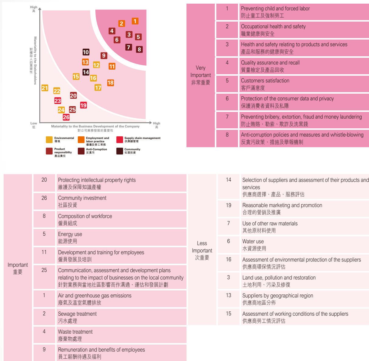
Picture 1 The Group's ESG Materiality matrix