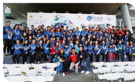
Picture 3 competition team of the Company for “Run for Survival” 圖3 公司「生態保衛賽」參賽團隊

集團員工志願參與香港海洋公園保育基金組織的泥灘清潔活動，幫助解決我們身邊的環境問題。同時，令公眾更加瞭解本地野生生態，從而提高參加者的保育意識。