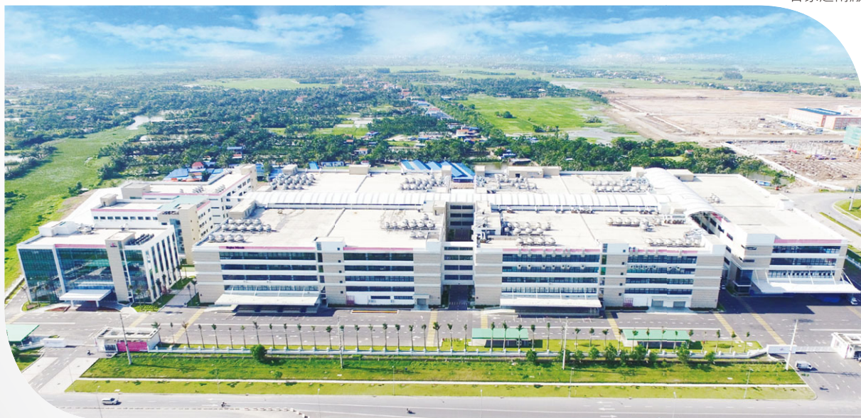
Second Vietnam Facility 第二家越南廠